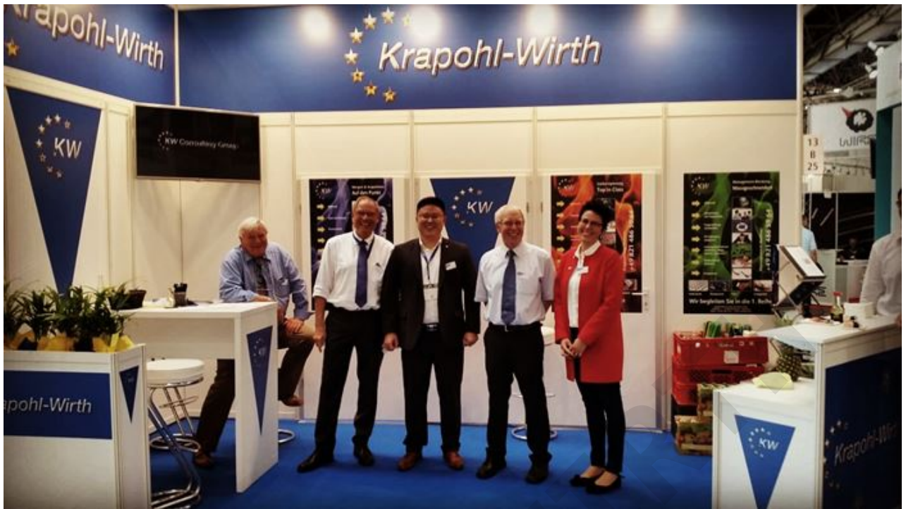
Our team would like to thank ...