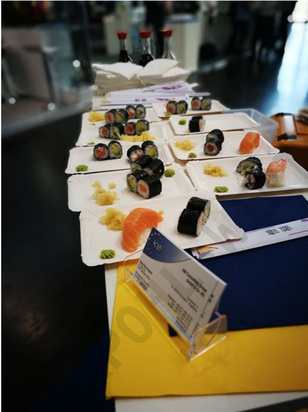
Our sushi was very appreciated ...